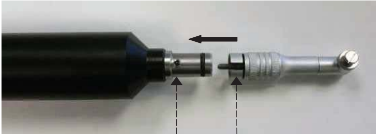
Alignment Pin Slot on prophy angle