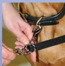
Small clip should be attached to the front ring of the harness