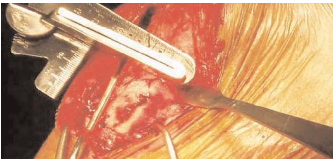
Adhesive drape at incision's edge.