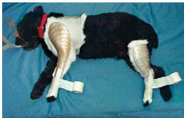
J-119 X, Y, Z